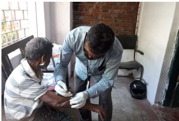
Skin Smear Collection at DPMR Clinic at Kaapor block 07.12.2020