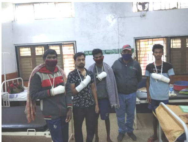
Post-Operative Care at Nabarangpur DHH,CCC 05.01.2021